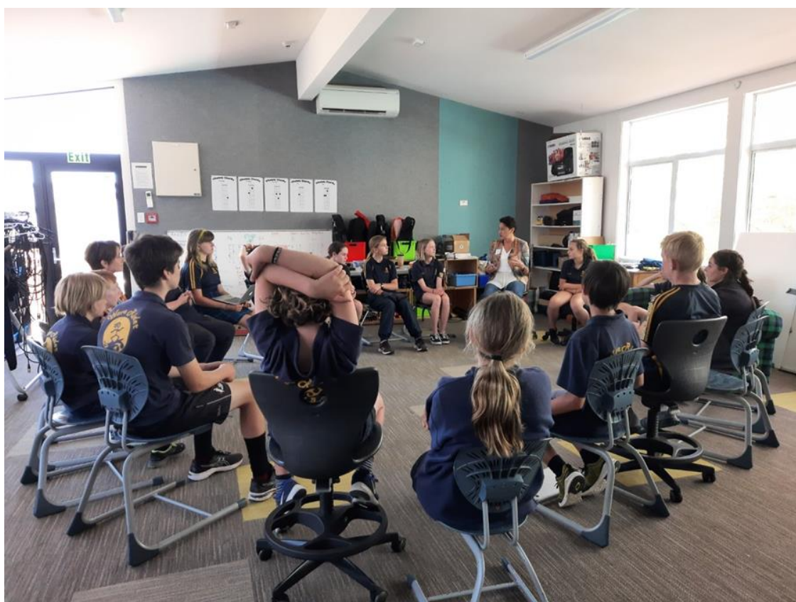
South New Brighton School's Climate Club, talking with Minister Poto Williams

We've been working with local schools to ensure children's voices are heard in the adaptation planning conversation. This is important, not only because decisions made today will have longer term effects on them, but also because children have rights under the UN Convention on the Rights of the Child to have a say on matters that interest and affect them.